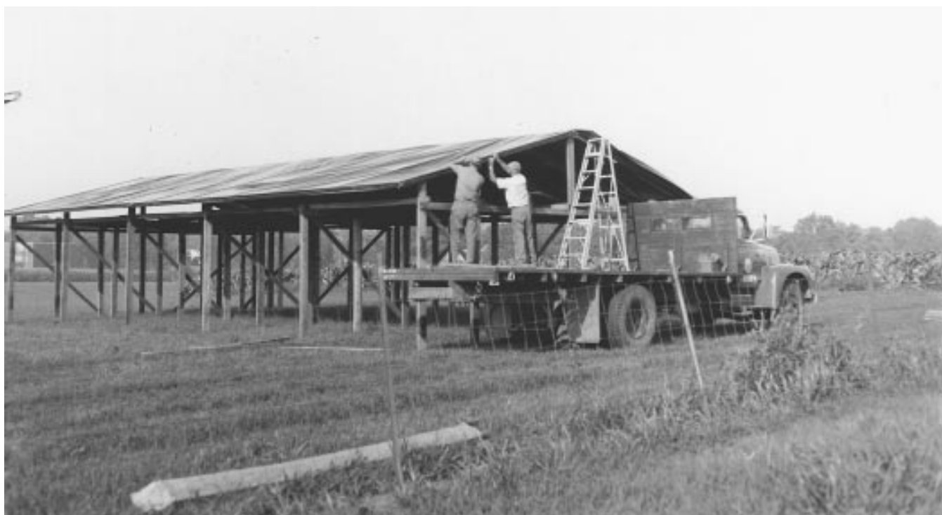
Figure 1. Construction of a pole-type plastic-covered curing structure.

Cured leaves at stalk positions toward the tip of the plant were slightly darker than corresponding leaves cured in the conventional barn, resulting in a $0.01 per pound lower market value for the tip grade. Since the tips were approximately three feet above the sod, the only apparent explanation for the darkened leaf is the high nightly humidity around the leaves and the high case of the tip leaves. Since the potential gain in value of this grade of tobacco was only $17 per acre (at 1968 prices), there is no apparent justification for any additional investment or labor to correct the situation other than selecting a well-mowed site with good water drainage and air movement.