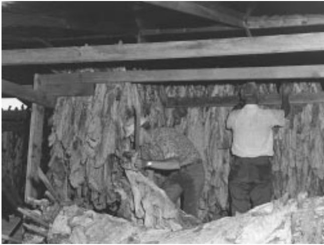
Figure 2. Tobacco housed from wagon bed. The wagon can be pulled through the structure during housing if end boards are removed, and tobacco can be loaded from front to rear.