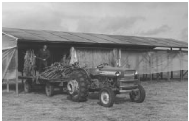
Figure 4. Cured tobacco can be easily bulked onto a wagon when in case for transport to a stripping room.