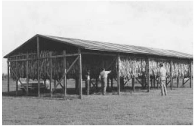
Figure 3. During the first two to three weeks of curing, the sides and ends of the structure can be left open. After approximately three weeks of curing, sidewall and end wall plastic curtains are attached to the rails and rail supports with nailed battens to protect the dry tobacco.

the tier rail should be about 1'-9". This is required to prevent plant stalks from puncturing the plastic. A rafter tie should be installed to prevent rafter separation at the ridge and to provide longitudinal reinforcement.