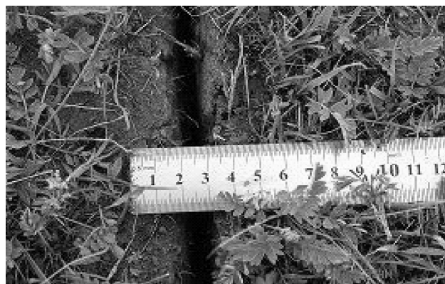
Figure 2 cutted Root and slot in soil .

Results and discussions Experimental plots were placed in selected Leylus-chinensis degraded grassland in The Hebei Guyuan Grassland Ecosystem observation research station . The root-cutting rate (the roots's proportion which were cut off) and the width of slot on the soil surface were increased when the cut root depth changed from 150mm to 200mm , Even if the depth is only then 150mm , the rate also achieved above 90% , and the width is only between 10~15mm . After cutting work had finished , the pasture plot looked like that in fig .2 . Compared with other soil cultivation conditions ,the cutter had broken the soil hard layer ,but it did not turnor plow the soil , . It created a slot which is a litter thicker than the thickness of the blade . The cutter had cut off most of roots ,but it did not destroy native vegetation , and there were fewer roots which had been drawn out of the soil .The use of this cutter could protect the soil against wind erosion or water erosion , and improve the soil structure to a certain extent , but it cannot change soil conditions like a loosening tiller .