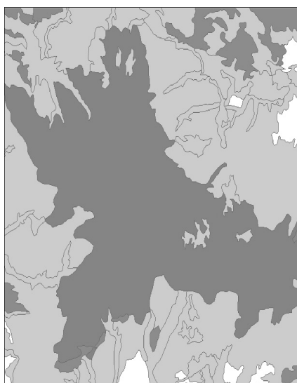
Figure 1 Soil mapping unit (dark gray) with sagebrush potential and 15% historic juniper woodland inclusions.

Materials and methods A pilot study was initiated in 2005 on 4 million ha in the Owyhee Uplands area where the states of Idaho, Oregon and Nevada join to develop assessment tools that could be used to develop a strategy to prioritize restoration treatments. The basis for determining the potential plant communities are USDA soil surveys (Third Order Soil Survey) and the ecological sites associated with mapped soils (Figure 1). Current plant communities are mapped using remote sensing, image analysis software, and ground data (Figure 2). Comparing the potential plant communities on a landscape with the current plant communities allows managers to identify potential treatment areas to restore desired native plant communities. In this example, encroachment of Western Juniper ( Juniperus occidentalis ), a native conifer tree, is replacing big sagebrush ( Artemisia tridentata ) and associated herbaceous species due primarily to fire exclusion.