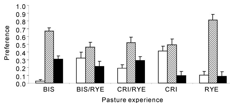
Figure 3 Relative preference in sheep that had grazed plots for 4 weeks previously sown with either B. pelecinus (BIS) or T. incarnatum (CRI) or L. rigidum (RYE) or B. pelecinus and L. rigidum (BIS/RYE) or T. incarnatum and L. rigidum (CRI/RYE). During the preference testing, the sheep were offered all three species simultaneously: open bars, BIS; hatched bars, CRI and closed bars, RYE.

If we want animals to eat a particular species in the pasture mix on offer, a situation should be created where the animals sample the plant little by little and have a positive experience of doing so. The positive experience may be achieved easily if a plant is nutritious, or it may require intervention such as the provision of a supplement (or a complementary plant species) to overcome a nutrient deficiency or avoid toxicosis. A positive experience usually leads to a situation where animals eventually choose to include the plant into their regular diet. An example of the influence of previous experience on selection was shown by Thomas (2005). In this study, the intake of three pasture species ( Trifolium incarnatum L., Biserrula pelecinus L., and Lolium rigidum Gaud.) offered simultaneously to sheep was heavily dependent on what species and what combinations had been offered to the animals in the past.