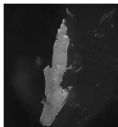
Spikelet differentiation stage