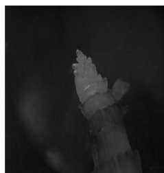
Double edge phase Spikelet