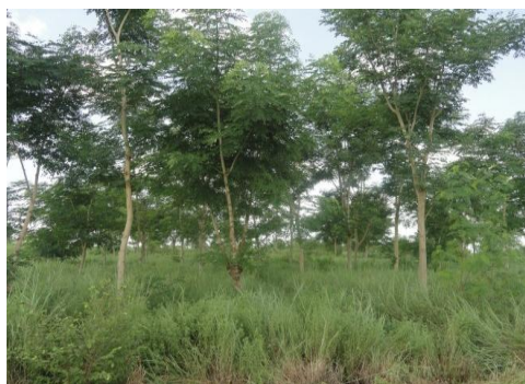
Plate 1: Albizia procera based silvipastoral system