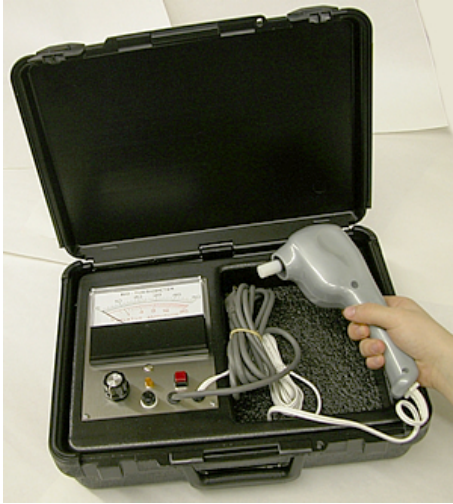
Figure 3.1 Bio-Thesiometer