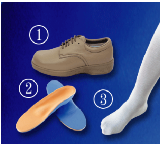
Figure 3.2: SmartStep™ System

All subjects were supplied with the SmartStep™ Stabilization System (SmartStep, Inc., Kansas City, KS). SmartStep™ consists of the following: 1) a pair of extra depth, diabetic shoes (Aetrex Worldwide, Inc., Teaneck, NJ) 2) a patented in-shoe semi-rigid orthotic (SmartStep, Inc.), 3) a pair of patented SmartKnit Seamless Socks, 4) a pair of Comfort System Lite Socks, 5) a pair of Sleep Socks with non-skid treads. (Figure 3.2)