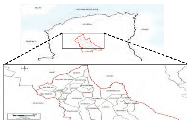
Figure 1. Location of the study area.

About 55% of agro-pastoralists had heard of climate change and had some understanding of the issue. Among those who have heard of climate change, 70% had heard about it via radio. All interviewees who have heard of climate changes, described the cause as a lack of rain, but all thought that temperatures will also rise significantly, and vegetation cover will decrease and sandstorms will occur with greater frequency resulting in greater sand accumul-