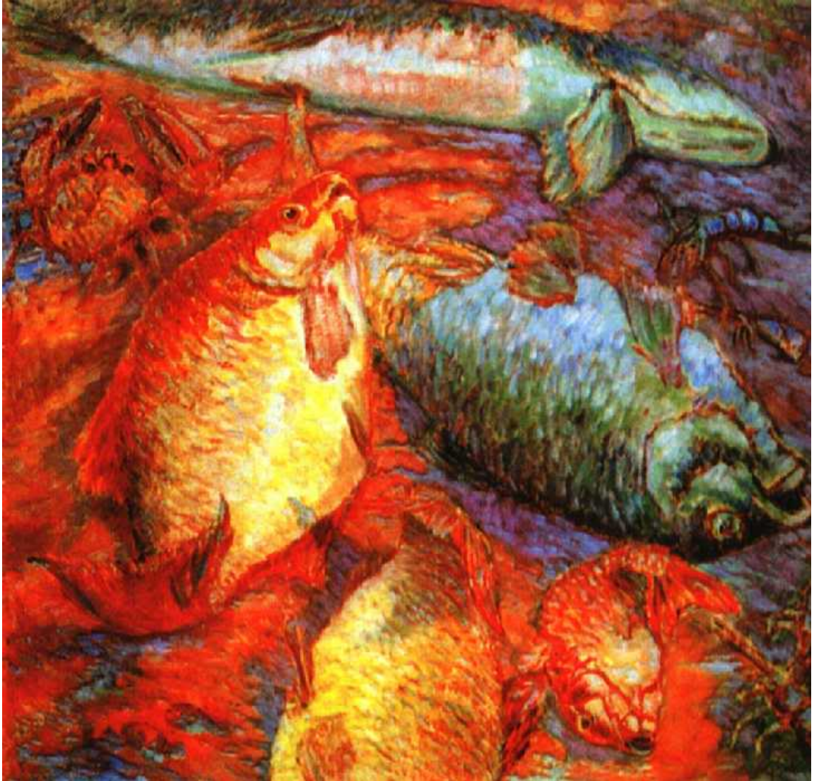
Figure II.4. Mikhail Larionov, Fish in a Setting Sun , 1904. State Russian Museum, St.Petersburg.