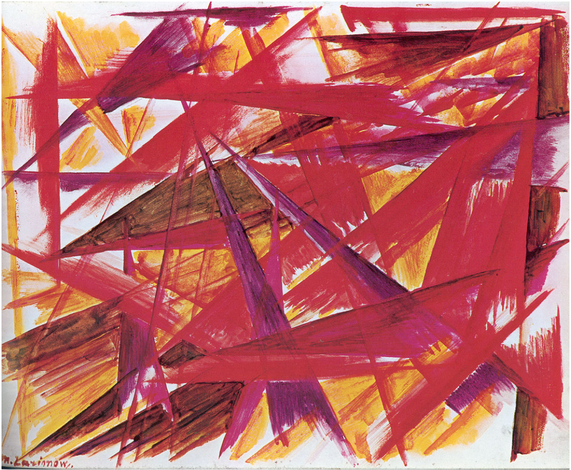
Figure III.2. Mikhail Larionov, Red Rayonism, 1913. Merzinger Collection, Switzerland.