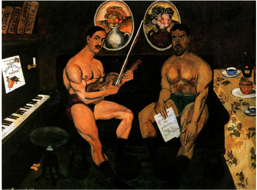
Figure III.1. Ilya Mashkov, Self-portrait and Portrait of Pyotr Konchalovsky , 1910. State Russian Museum, St.Petersburg.