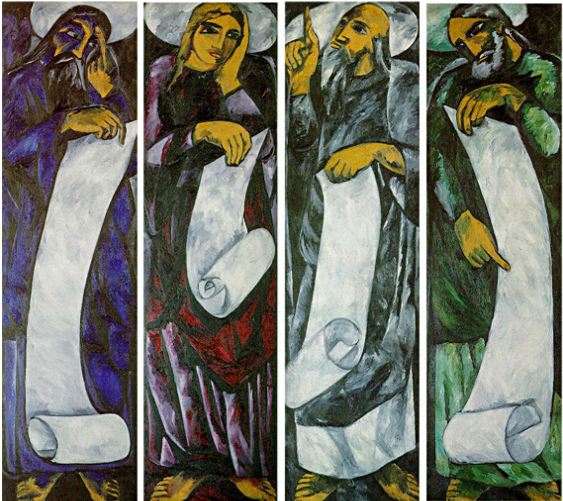
Figure II.6. Natalya Goncharova, The Evangelists , 1910. State Russian Museum, St.Petersburg.