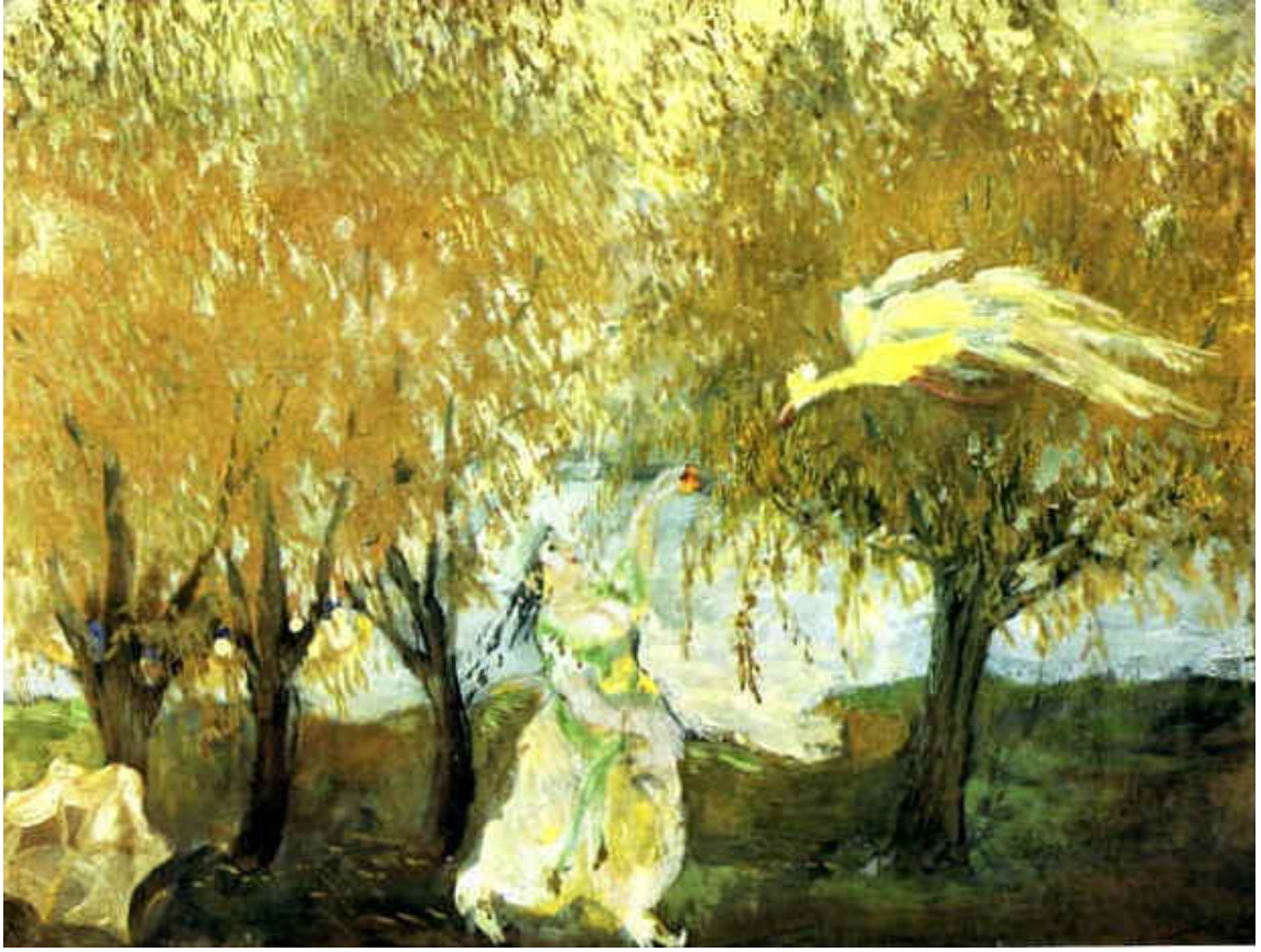
Figure II.2. Mikhail Larionov, A Woman and a Flamingo (from Arabian Nights series), 1898. J.E.Rubinstein Collection, Moscow.