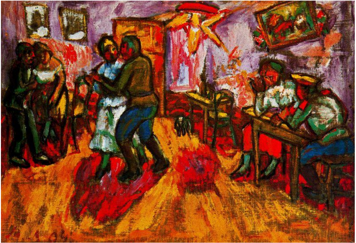
Figure II.7. Mikhail Larionov, Petite Cabaret , 1905-08. Galerie Beyeler, Bale.