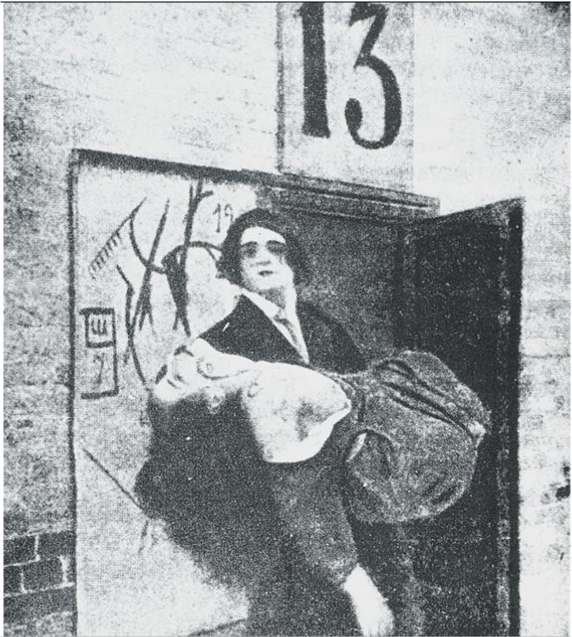
Figure IV.2. Still from the film Drama in the Futurists' Cabaret No. 13 , 1914. Illus.in Anthony Parton's Mikhail Larionov , (Princeton: Princeton University Press,1993) 68.