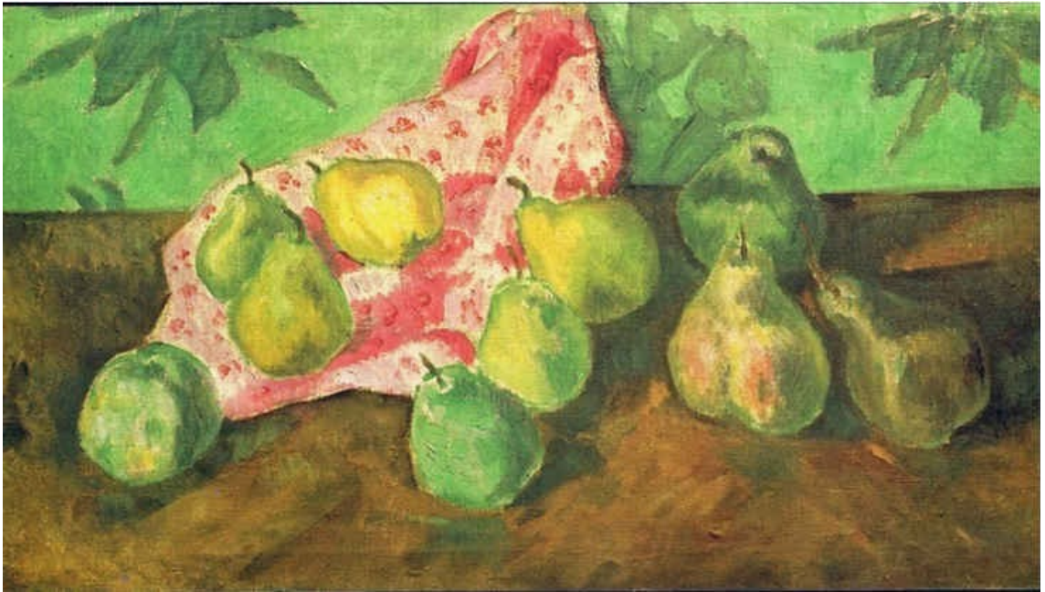
Figure II.1. Mikhail Larionov, Still Life with Pears , 1907. State Russian Museum, St.Petersburg.