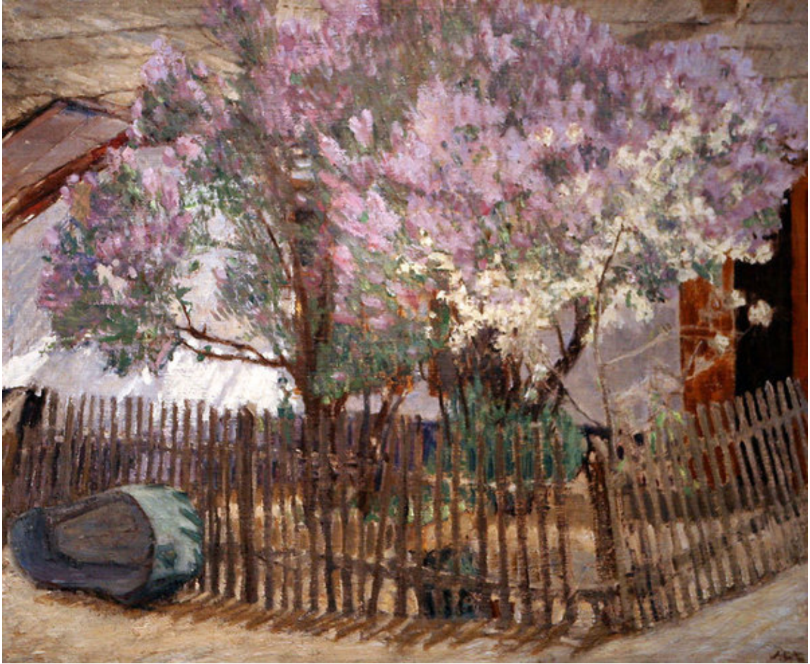
Figure II.3. Mikhail Larionov, Lilac Bush in Flower , 1905-06. State Tretyakovskaya Gallery, Moscow.