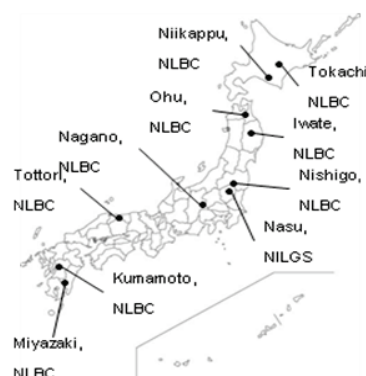
Figure 1. Location of the monitoring sites.

Field experiments were conducted at 10 sites across Japan: 9 stations at the National Livestock Breeding Center (NLBC), and 1 at the National Agriculture and Food Research Organization Institute of Livestock and Grassland Science (NILGS), Nasu Research Station (Fig. 1).