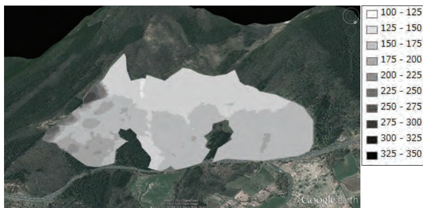
Figure 2. Spatial distribution of radioactive Cs activity in the pasture ( \text{kBq/m}^2 , Tsuiki and Maeda 2012a; 2012b). The square within the map is site A and B. The terrain is exaggerated three times in elevation.