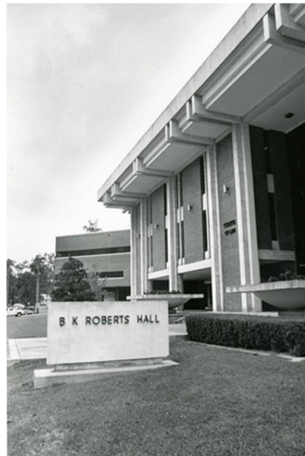
The College of Law building and the newly built law library in 1986.

While the library had found its way into the law school proper, it still didn't have a building of its own with which to further expand its collection. It wasn't until a large-scale renovation project that an adjacent and connected law library building was completed in 1983. Fortunately, for both librarians and the collection, the library hasn't had to change locations since.