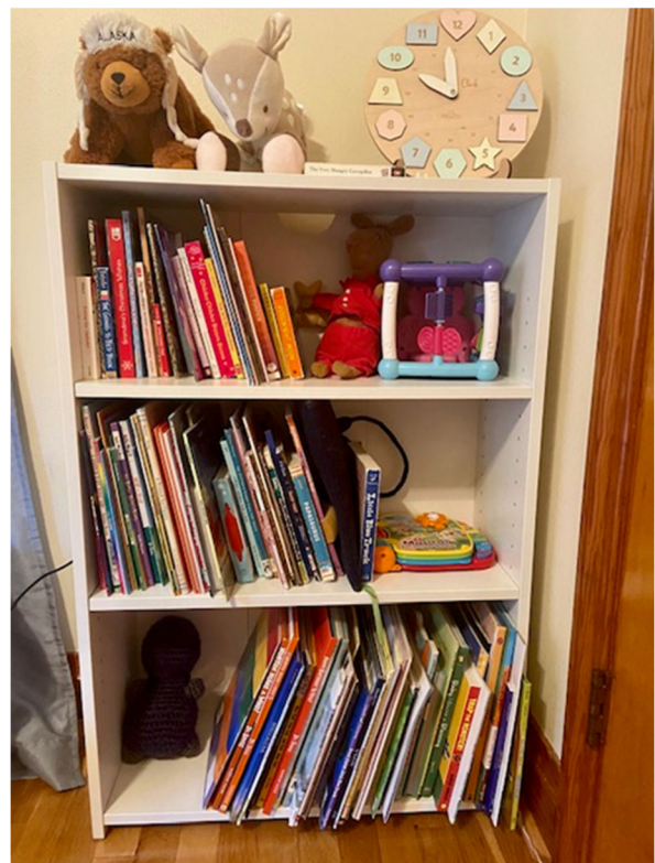
The author’s white bookshelf full of colorful children’s books and toys.

Although I’ll probably never have a library like Belle’s, I’ve found that having a house full of stories and imagination is just as fun as the aesthetics and even more meaningful. Even if some of them are tucked away in unconventional places, the magic is still there waiting to be opened.