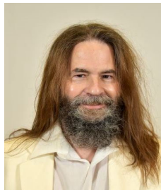
Fran Norton Jr. Law Library of Louisiana

Law students and the public spend a fair amount of time staring at instructional videos and online classes on their computers. However, these videos are often not the best looking or best sounding productions. They are not exciting, and they don't engage the viewer. Think of the teacher in the Peanuts cartoon always saying "wah wah wah," or Andy Warhol's Empire .