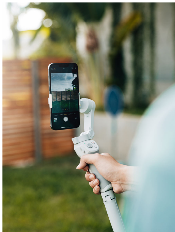
A hand holding a phone on a gimbal.

Take advantage of that. You may use a tripod to operate the camera in a fixed position, but if you want movement in your video, you should consider attaching your phone to a gimbal. This device allows smooth, balanced shots. Shaky camera videos are fine for "found footage" horror movies, but not for instructional videos.