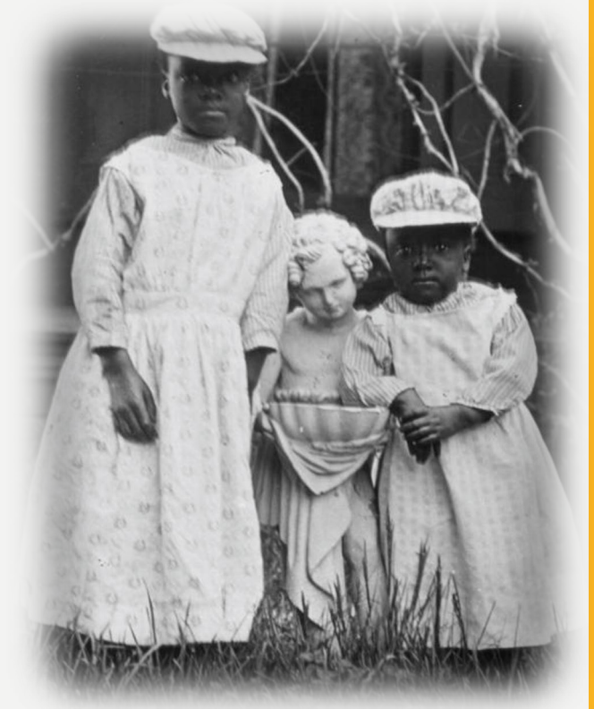
African American children leaning on a white statue.