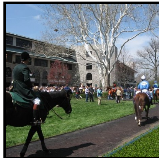
Paddock at Keeneland.

A limited number of tickets will be available for the Keeneland Spring 2015 Meet excursion through the SEAALL conference website. Where else can you enjoy world class Thoroughbred racing, unrivaled people watching, and delicious libations all within a National Historic Landmark? Reserve your spot today!