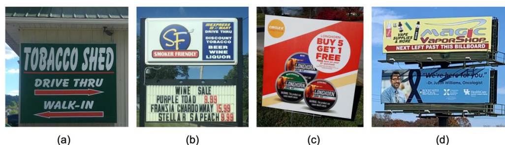
Figure 2. Marketing: Advertisements for tobacco products and tobacco barns. Student-submitted captions: (a) “Cancerous convenience”; (b) “Cancer friendly?”; (c) “This display sign at a local gas station seems to be encouraging people to purchase their smokeless tobacco. The labels explicitly state that use of this product may cause mouth cancer”; (d) “Irony in marketing”.

Distinct from the photographs of risk factors themselves were photographs of various marketing techniques which promoted the sale of these risk factors (Figure 2). Billboards and window signs boasted cheap tobacco products and emphasized the location of stores which sold tobacco. Photographs included tobacco “barns,” which conveniently provide consumers with the option to buy tobacco products at a drive-through window.