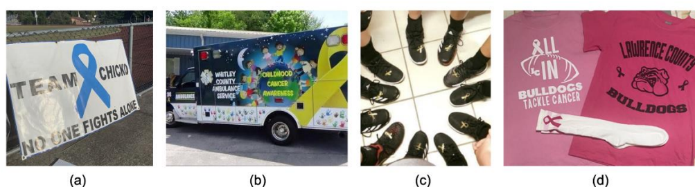
Figure 3. Awareness and support: Community events to raise cancer awareness. Student-submitted captions: (a) “A banner hung on the fence of the high school football field to honor a beloved coach and father of five during his battle with cancer. The banner has stayed up long after his passing”; (b) “One of Whitley County’s prized ambulances raising awareness for childhood cancer”; (c) “Whitley County’s volleyball team wears ribbons in support of a senior student being diagnosed with testicular cancer”; (d) “These three items have been worn by my cheerleading team at football games. Cheerleaders are noticed by many people on Friday nights, so wearing items like these will surely raise awareness in the community. Raising awareness is crucial to lowering the number of cancer cases in Kentucky”.

Participants submitted photographs of cancer awareness and support initiatives which took place in their communities (Figure 3). While some initiatives were planned and organized in support of specific community members who had been diagnosed with cancer, others were simply traditions or annual events. Photographs included shirts, signs, and vehicles with messages about cancer, images of awareness ribbons, and names of affected community members.