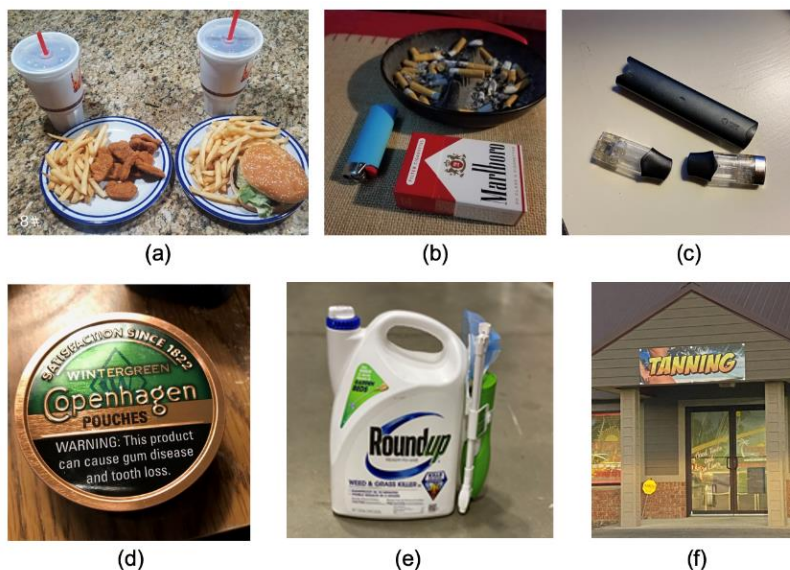
Figure 1. Risk factors and exposures: Diet, tobacco, and chemicals. Student-submitted captions: (a) “Continually eating an unhealthy diet can contribute to obesity, which can lead to cancer”; (b) “This picture represents cancer to me because smoking is one of the main causes [of] cancer”; (c) “A high school student’s vaping device, confiscated by his mother”; (d) “Can of Copenhagen that belongs to a 78-year-old male from Eastern Kentucky”; (e) “Roundup is the most widely used herbicide in the world. Roundup contains glyphosate. Large amounts of glyphosate can lead to Non-Hodgkins