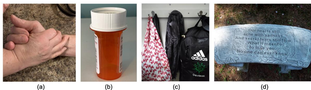
Figure 5. Experiences: Loved ones suffering from cancer and objects reminiscent of them. Student-submitted captions: (a) “This is a picture of my grandparents holding hands. When my Mamaw was diagnosed with breast cancer, my Papaw dedicated all of himself to helping her as much as he could. He exhibits the gentleness and love of caretakers, who help their loved ones when they need it most”; (b) “This is a picture of a medicine bottle. When a person goes through cancer, they must take several types of medication”; (c) “A scarf my mother wore on her head during her chemotherapy treatments, forgotten in the closet”; (d) “My beloved Papaw was 62 when he lost his battle with cancer. I was three years old”.

Photographs also captured objects that reminded the participants of their personal experiences with cancer (Figure 5). Photographs in this theme included belongings of loved ones who had been diagnosed with cancer or who had passed away from the disease. According to the submitted captions, items such as hats, scarves, shoes, and jewelry were representative of friends and family members of the participants who had an experience with cancer. Four photos depicted memorials and graves of those who had lost their lives to cancer. Five of the photos captured medications, test results, and assistive devices of loved ones being treated for cancer. Nine photos captured the loved ones themselves, typically taken at a time before the cancer diagnosis, during treatment, or while spending time with family members and friends.