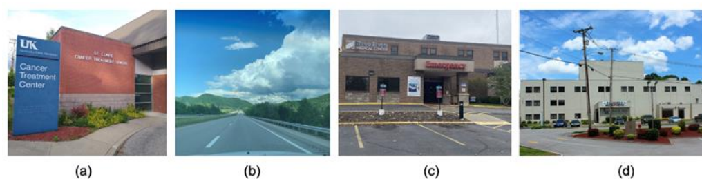
Figure 4. Health care: Health care resources and barriers. Student-submitted captions: (a) “A cancer treatment center in Morehead, KY”; (b) “While driving home from Lexington, the mountains in Stanton, Kentucky, are the first sign I’m getting close. These mountains, while beautiful, represent barriers that many face while getting cancer treatment in eastern Kentucky”; (c) “Many Kentuckians avoid seeing a doctor, even if they are experiencing symptoms of cancer. When less people are screened for cancer, less cases are caught before it’s too late”; (d) “This little hospital in Paintsville is where many may have their first interaction with cancer, whether it is getting a preventative procedure, a surgery, or visiting a sick friend or family member”.

small treatment centers serving as remote branches of larger health care organizations. Also submitted were photographs of objects which reminded participants of the lack of access community members have to health care resources in rural areas. One photograph depicted a trailer, which the participant explained in his caption represented communities of lower socioeconomic status, which have higher cancer mortality rates. Another photograph showed a mountain range in rural Kentucky, which the participant described as a geographical barrier to care.