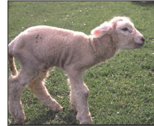
Figure 2. Lamb with goiter.

Although infrequent, brassica crops can cause animal health disorders if grazing is managed improperly. Most brassica-related disorders in cattle tend to occur during the first two weeks of grazing while adjusting to the forage. The primary potential disorders are polioencephalomalacia or PEM, hemolytic anemia (mainly with kale), nitrate poisoning, and pulmonary emphysema. Other possible clinical disorders include bloat and rumen acidosis, and metabolic problems such as hypomagnesemia and hypothyroidism with goiter (Figure 2). Glucosinates present in brassicas are precursors of irritants that can cause colic and diarrhea. Large bulbs may lodge in the esophagus and lead to choking. Certain brassicas (specifically rape) can cause sunburn or “scald” on light-skinned animals, especially when grazed while the plants are immature. Other potential problems include oxalate poisoning and off-flavoring of meat and milk. The following is a brief description of the potential disorders and the mechanisms by which they occur.