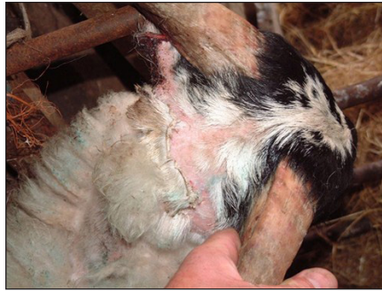
Figure 3. Photosensitization (sunburn or rape scald).

Acute respiratory distress syndrome may develop when cattle are given sudden access to brassicas (usually turnip fields) following relatively dry, high roughage diets. Pulmonary emphysema causes rapid, difficult breathing accompanied by a grunt on expiration. Affected animals stand with extended heads, dilated nostrils, and open mouths with protruding tongues. Death may occur within two days. Surviving animals have