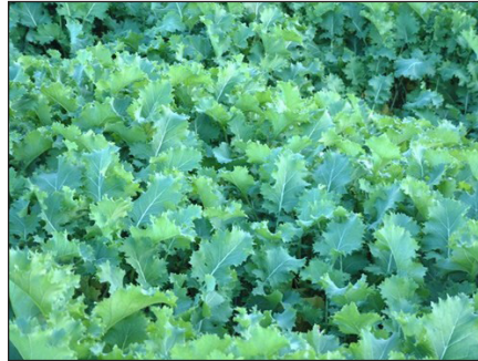
Figure 1. Kale, a type of brassicas.

Brassicas (including turnips, rape, kale, and swedes or rutabagas) are highly productive, digestible forbs that contain relatively high levels of crude protein and digestible carbohydrates (Figure 1). Animals will readily consume the tops and will also grub the root bulbs out of the ground. These winter annuals are often grazed with no ill effects yet, on occasion, adverse effects do occur. Brassicas have a readily digestible carbohydrate content but are relatively low in fiber so cattle should be provided a fiber source to prevent rumen acidosis or bloat. Brassicas should be limited to 70% or less of total cattle diet dry matter. Interseeding brassicas with cereal grains such as wheat, rye or oats is often recommended rather than using a pure stand to ensure adequate fiber is consumed by grazing livestock. Adjacent pasture, corn stalks, or palatable hay can also be offered to provide additional fiber. Cattle