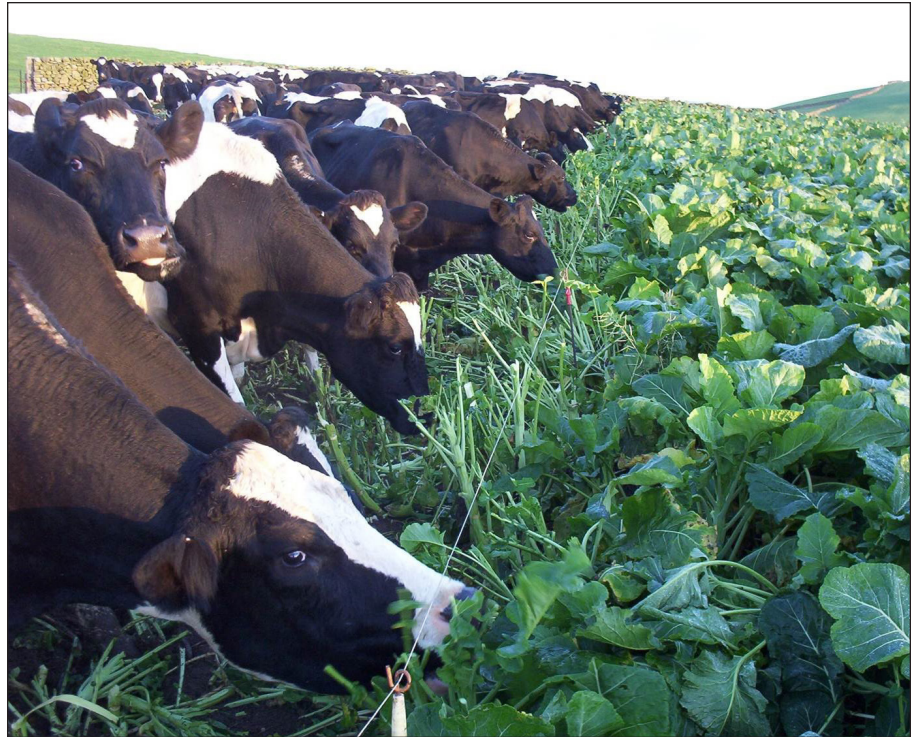
Figure 4. Holsteins grazing on brassicas.