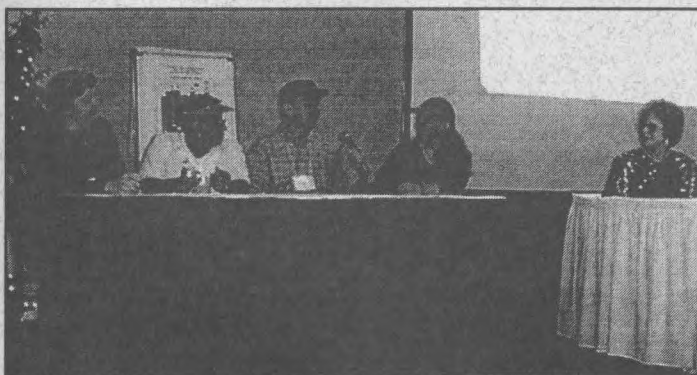
SEAALL Game Show — Family Feuding

I look forward to seeing many of you in Seattle at the AALL Annual Meeting in July. We will once again get together for a short business meeting and reception July 14 at 5:15 p.m. I look forward to another great year!