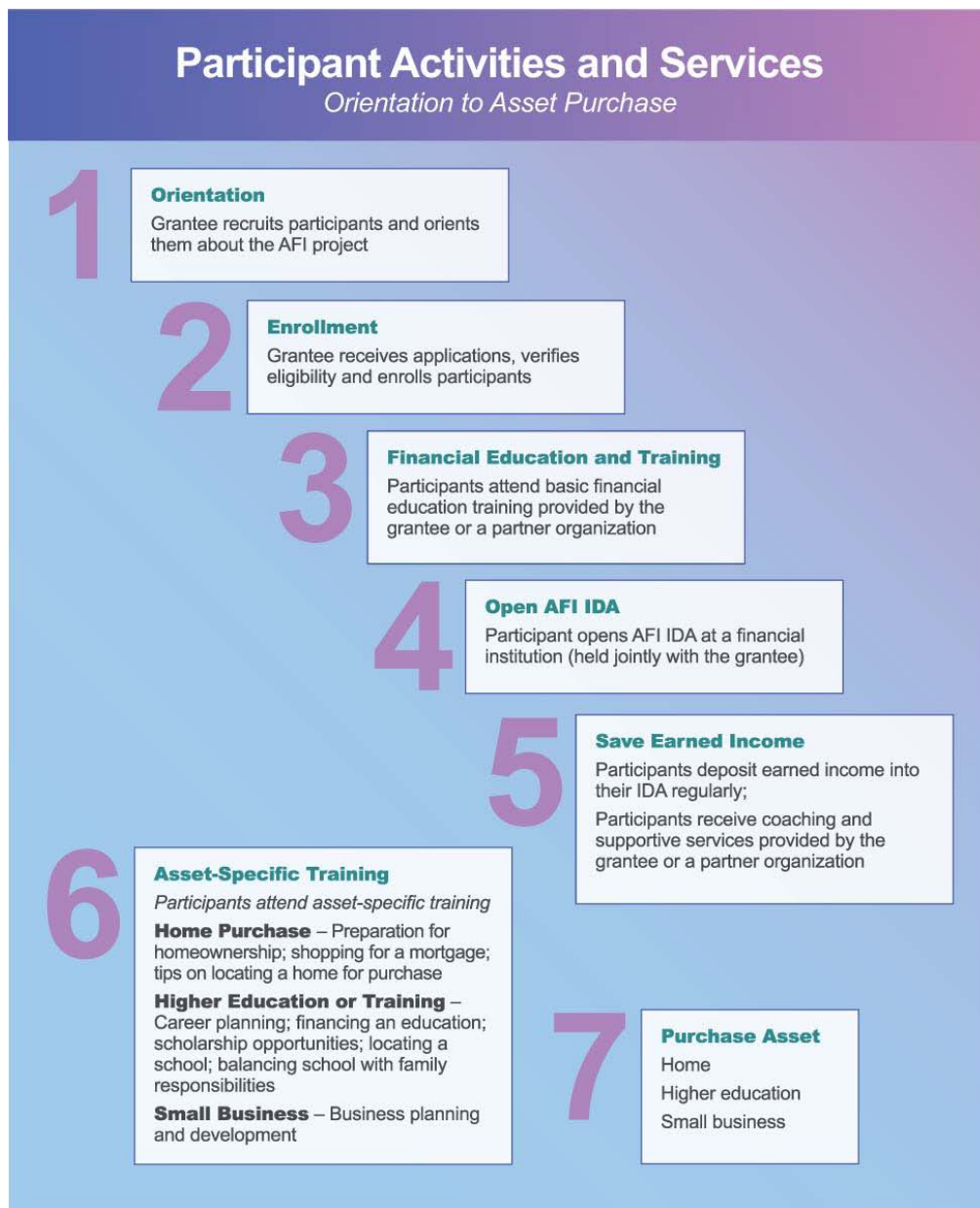
Figure 1: Components of a Typical AFI Project

A typical IDA program is outlined in Figure 1. Note that this figure illustrates a participant’s path in a generalized AFI program. Individual AFI programs may follow different procedures. For example, some grantees require financial education before participants open the IDA, while other grantees allow participants to open the IDA and begin saving before or while receiving the education. 4