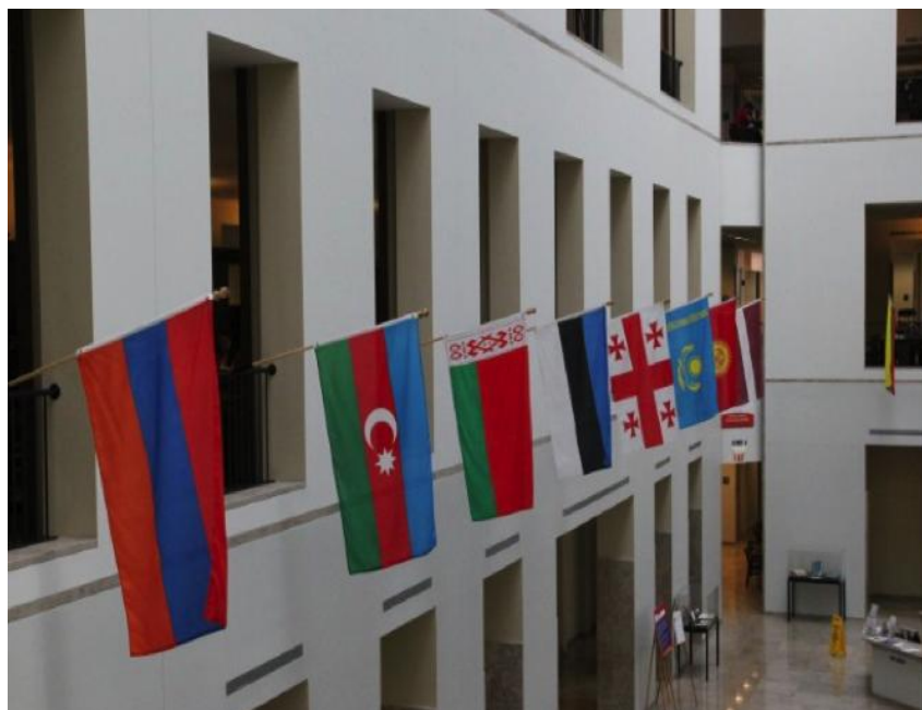
Flags representing Eurasian nations hang in the Young Library atrium.

The other areas initially identified have not been neglected. Library participation in externally focused projects is dependent on the scope of the project and the willingness of faculty