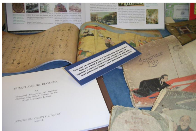
The Young Library hosted exhibits and workshops in 2013 in celebration of the 10 th anniversary of the Asia Center.

Work continues on the internationalizing of UK libraries. The working group and the Library Staff