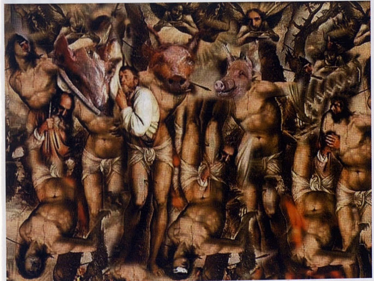
"Pool of Saints (version 1)"