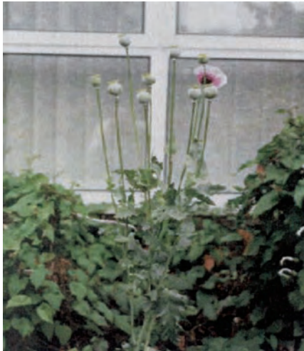
Fig. 1. Putative P. somniferum , yielding morphine, growing wild outside a Dublin, Ireland research laboratory.

A 100 ng/ml reporting limit for morphine is well supported in the scientific literature. The intravenous “No Effect Dose” for locomotor responses to morphine in horses is \sim 0.1 mg/kg or 50 mg for a 1000-lb horse. This dose yields peak urinary concentrations of morphine glucuronides of \sim 22,000 ng/ml; therefore, the dose to produce a urinary concentration of 100 ng/ml is \sim 250 \mu g, a dose highly unlikely to produce a pharmacological effect. Another consideration is that oral morphine is unlikely to be more than \sim 20\% bioavailable in the horse, further reducing the probability of a pharmacological response from environmental (oral) exposure to morphine.