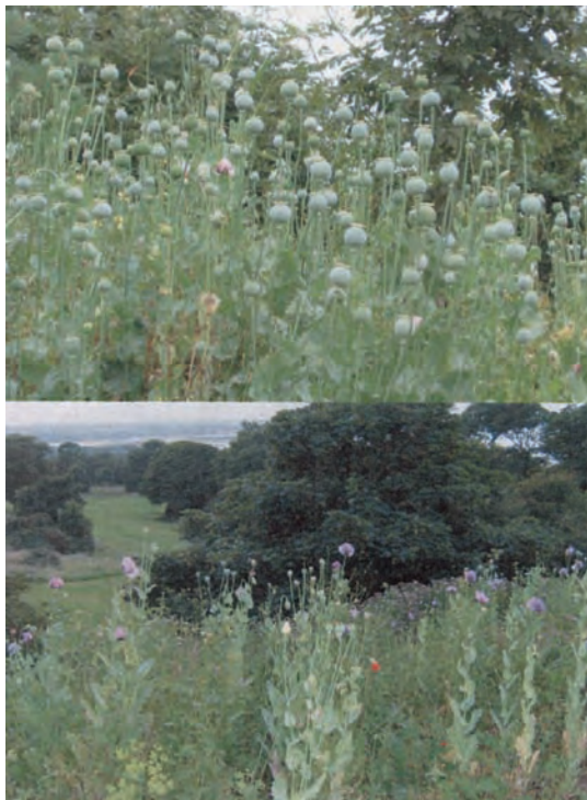
Fig. 3. Putative P. somniferum , yielding morphine, growing wild in rural Ireland. 18

Our colleagues soon showed that these sporadic “wild” sources of morphine have the potential to yield more than sufficient opium/morphine to give rise to low-level identifications of morphine in horse urines. 18 In assessing the significance of these Irish and other similar findings that we will set forth, we must bear in mind that man has been cultivating and using P. somniferum for at least 5000 yr, and it is only within the last 100 yr that its