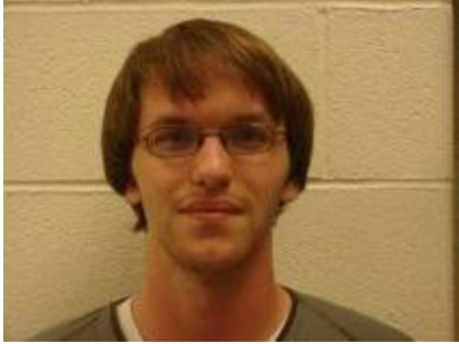
Faculty Mentor: Dr. Thomas R. Zentall

Research has shown that pigeons, much like humans, will gamble for a larger payout that occurs less frequently rather than a smaller payout that occurs more often, even if the small payout has a greater net value. Zentall & Stagner (2010) gave pigeons a choice between one alternative that 20% of the time provided a stimulus that always predicted food and 80% of the time, a stimulus that always predicted the absence of food and a second alternative that provided a stimulus that predicted food 50% of the time. They found that pigeons had a strong preference for the alternative that predicted food 20% of the time. A study using this same concept, except where reinforcement was provided in magnitude (number of pellets), had similar results. In this case, pigeons chose to receive 10 pellets 20% of the time (2 pellets on average) over 3 pellets all of the time (Zentall & Stagner, 2011). Thus, much like human gamblers, pigeons choose less food over time in order to receive the stimulus that predicts the larger outcome. Using this finding as a foundation, we asked if observation of a demonstrator gambling or not gambling would inform an observer's decision to gamble. That is, would pigeons tend to imitate the choice of another pigeon?