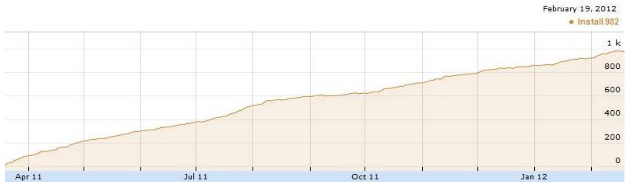
Figure 2. Active Installs of the "Machinery Sizing" App