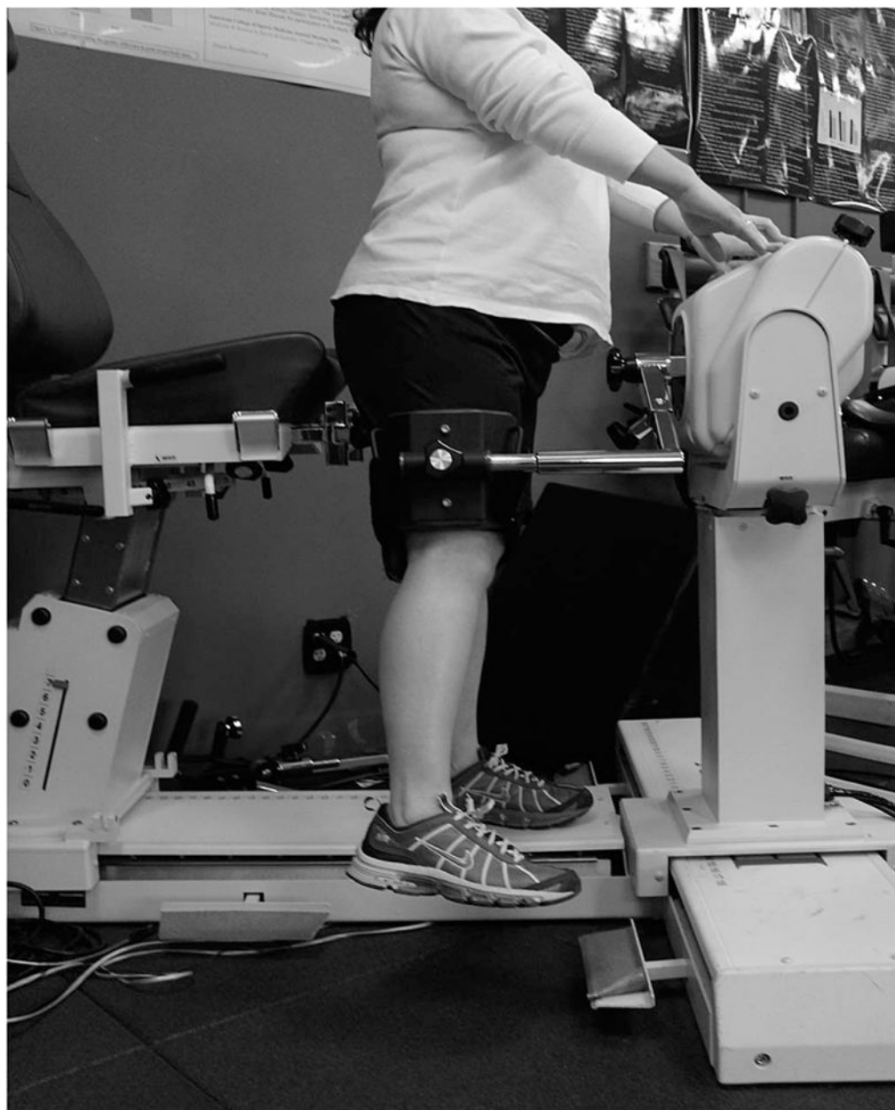
FIGURE 2. Positioning for standing hip abduction and adduction testing.