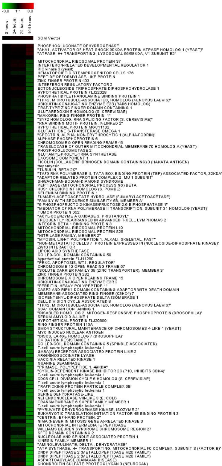
Figure 3 Expression profiles for cluster 2. Each row represents an individual gene, and each column a post-infection time point. Red coloration indicates increased expression of a gene relative to uninfected animals, and green indicates decreased expression. Genes (Cluster 2, n = 105) identified to be significantly down-regulated in response to ATV infection.