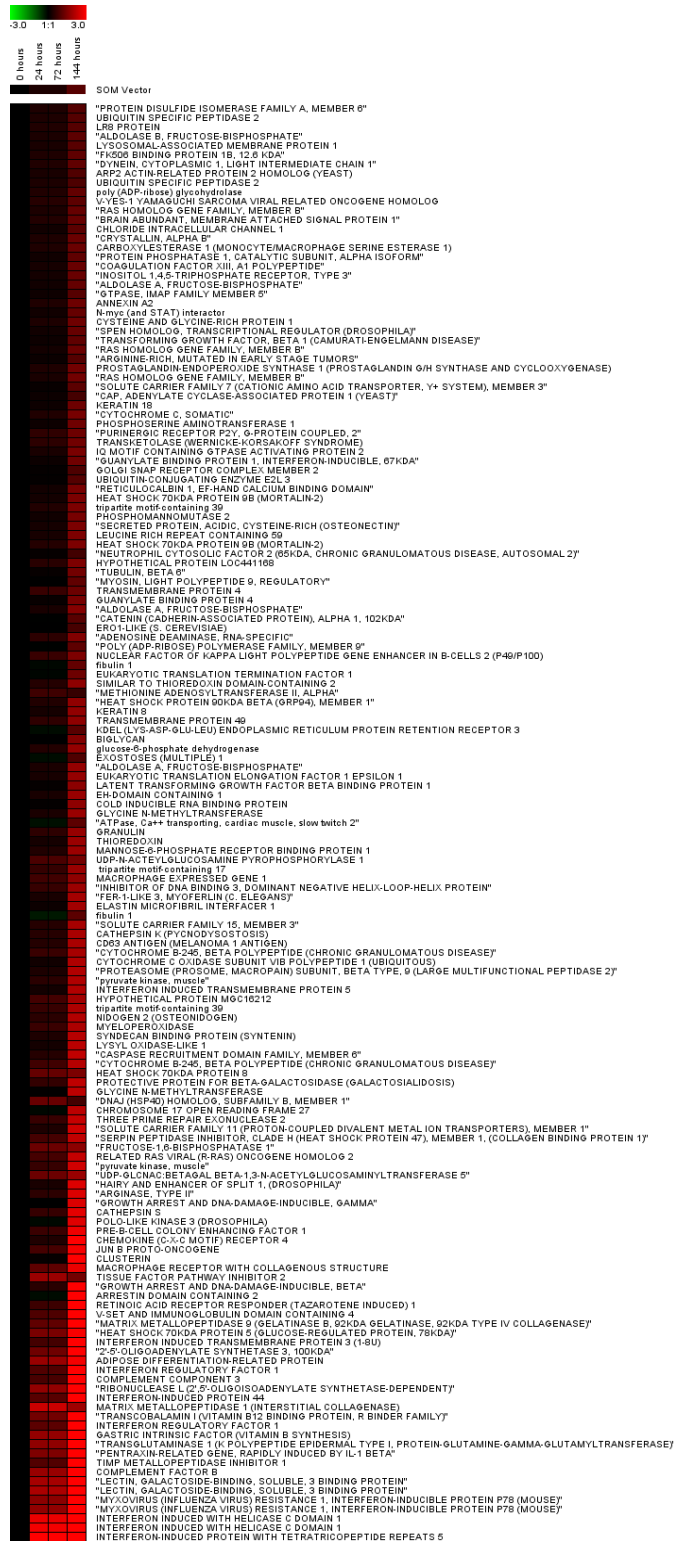
Figure 2 Expression profiles for cluster I. Each row represents an individual gene, and each column a post-infection time point. Red coloration indicates increased expression of a gene relative to uninfected animals, and green indicates decreased expression. Genes (Cluster I, n = 158) identified to be significantly up-regulated in response to ATV infection.