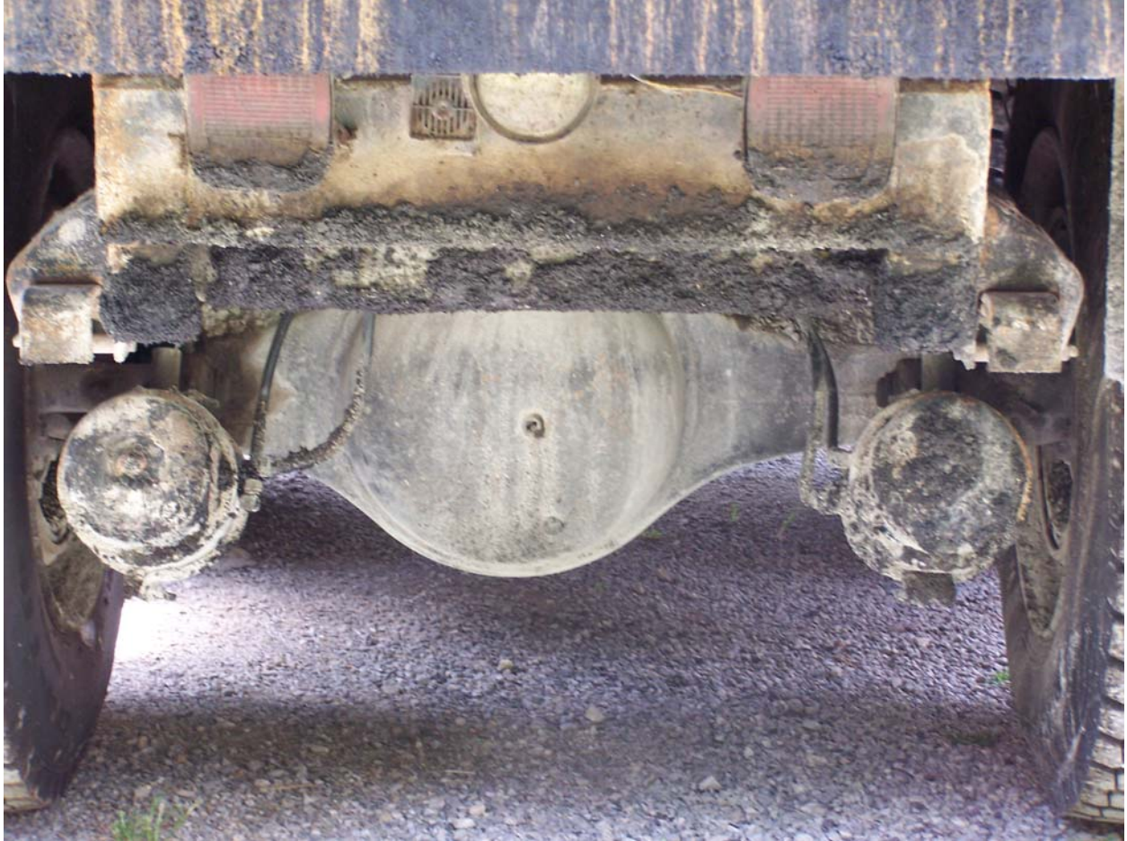
Photo 3: Picture of brakes and pneumatic lines at rear of truck. Truck bed is flat.