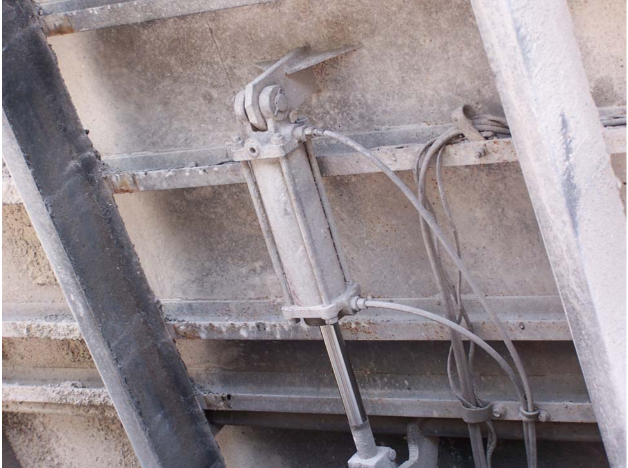
Photo 5: Picture of cylinder and pneumatic lines for tailgate trip handle system. One line goes to air tank; the other to a switch in truck cab.