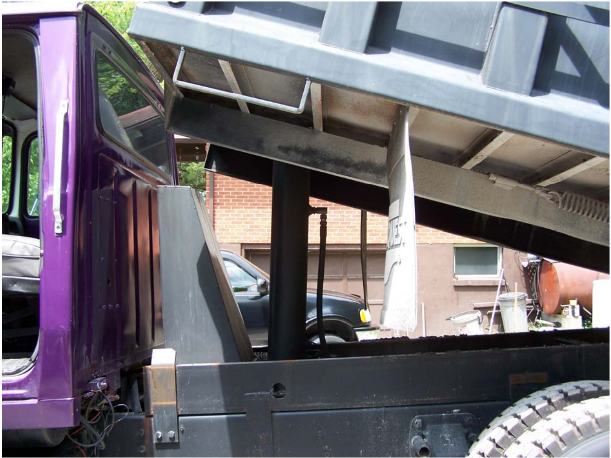
Photo 4: Picture of bed raised at the approximate height when it was raised for Driver 1 and Driver 2 to examine pneumatic connections.