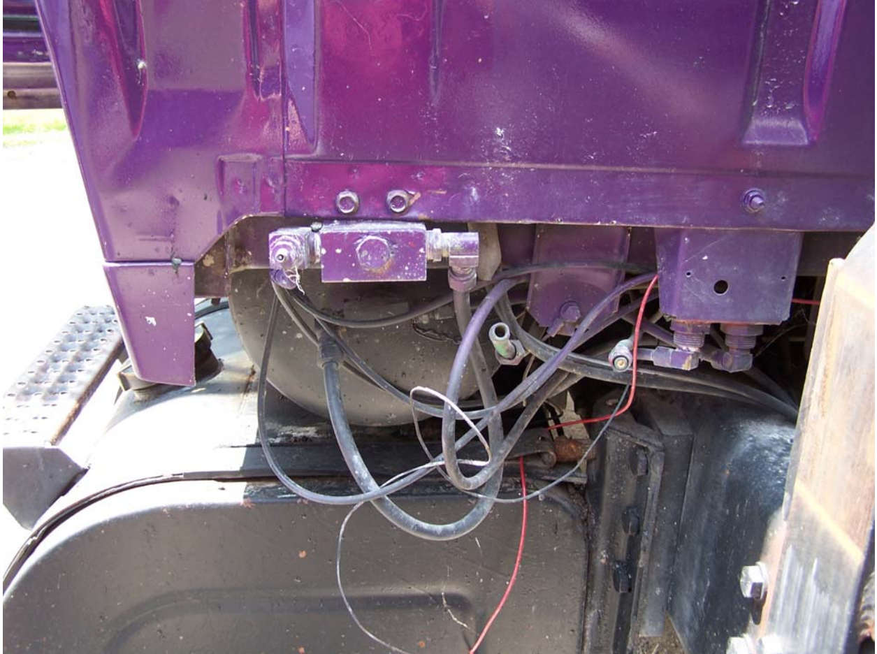
Photo 7: Picture of air tank shared by brake lines and tailgate system