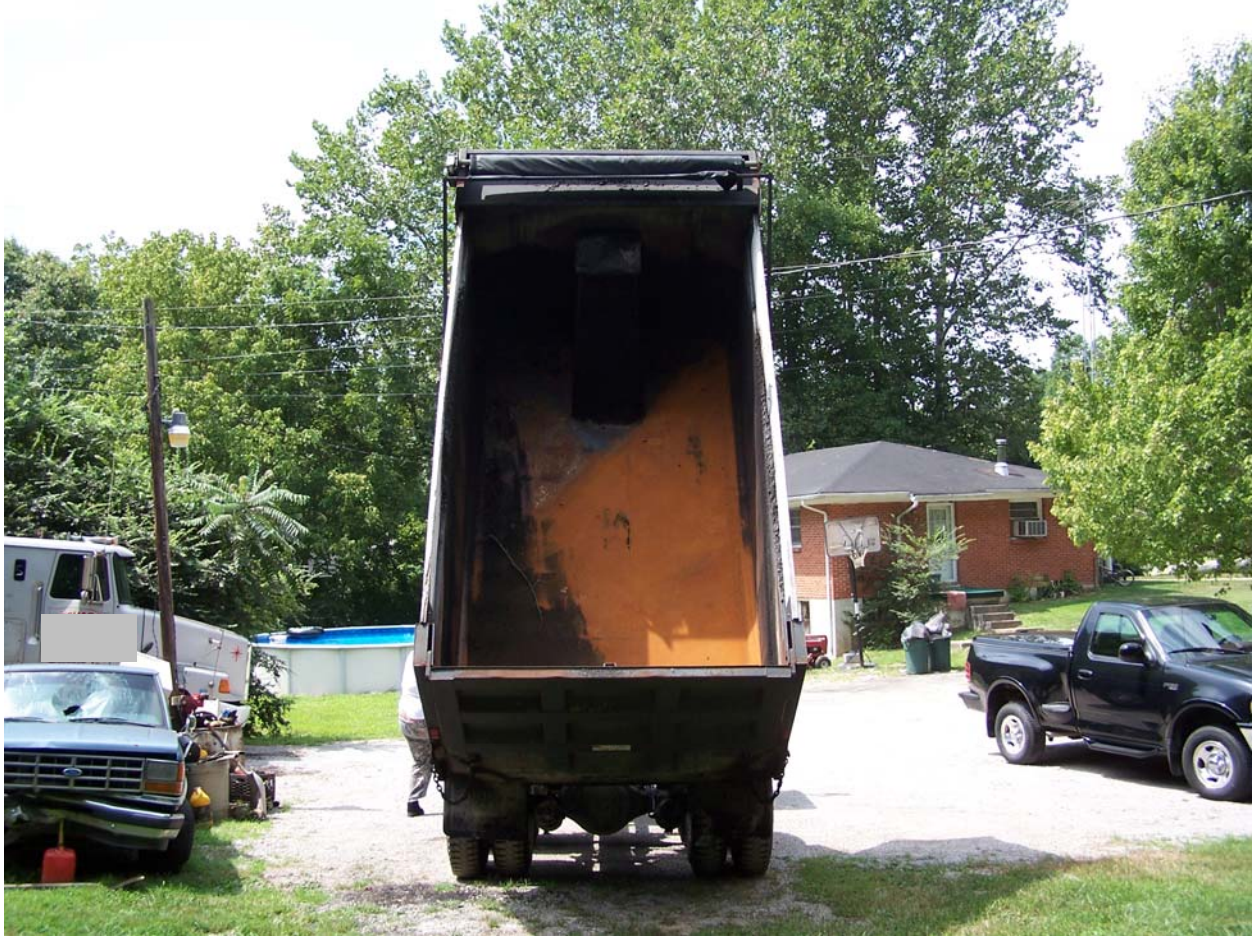
Photo 6: With truck bed raised, there was not room to inspect pneumatic line connections at the rear of dump truck.