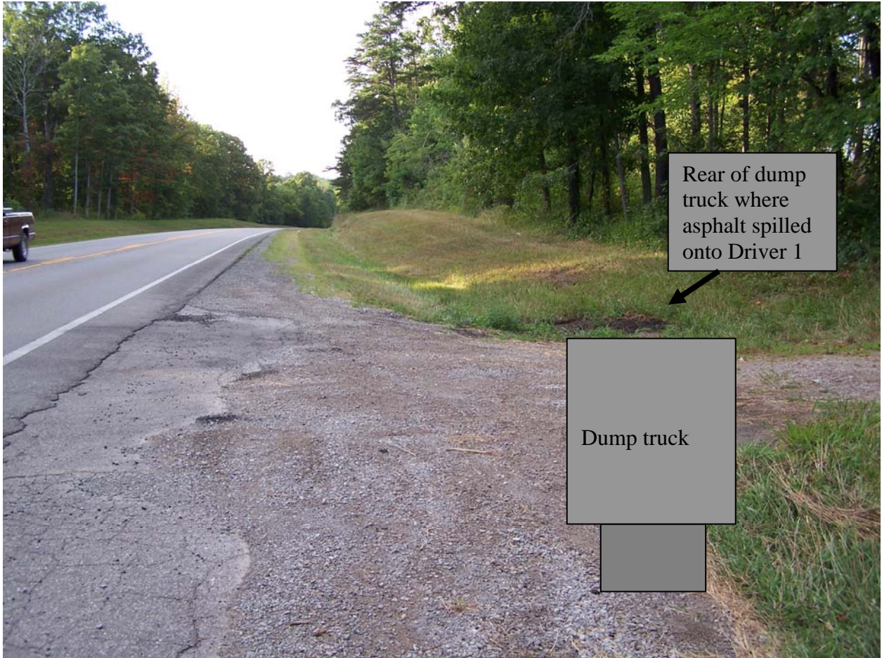
Photo 2: Northbound shoulder where Driver 2 parked dump truck. The dump truck was facing south.