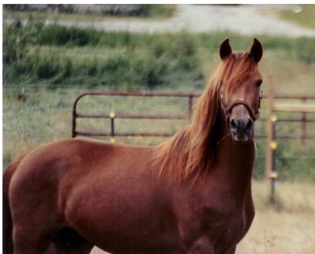
Figure 3 A chestnut Morgan horse that carry the Silver mutation. This particular individual (Amanda's Suzie Q) indicate that the Silver mutation in horses has little or no effect on pheomelanin (as mane does not seem to be diluted).