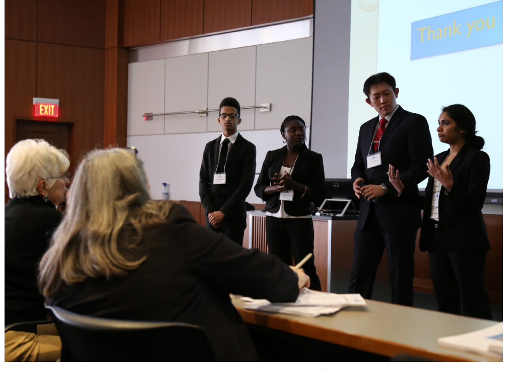
A multidisciplinary student team presenting their strategy to the global health case competition judges.