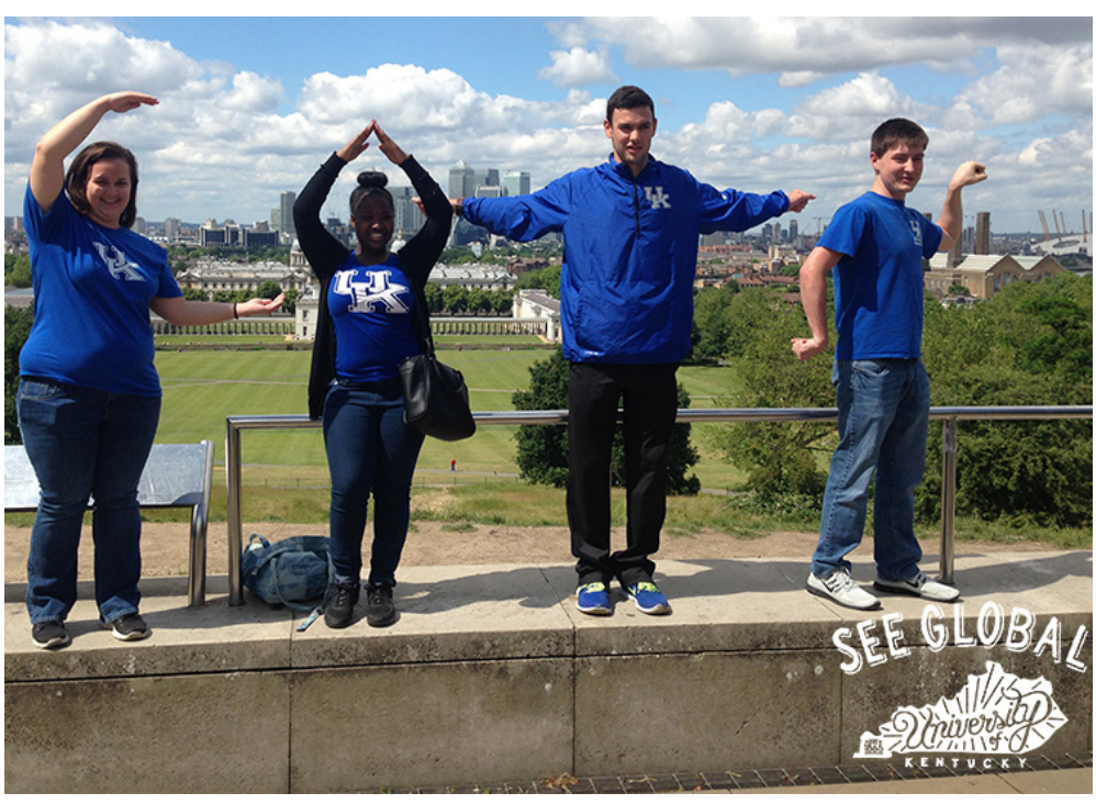
First-generation UK students in London.

The UK Office of First Generation Initiatives addresses these issues. Through tailored pre-departure sessions and programming, the course is designed to create a strong community among the students before they even set foot on a plane (some for the first time). The course