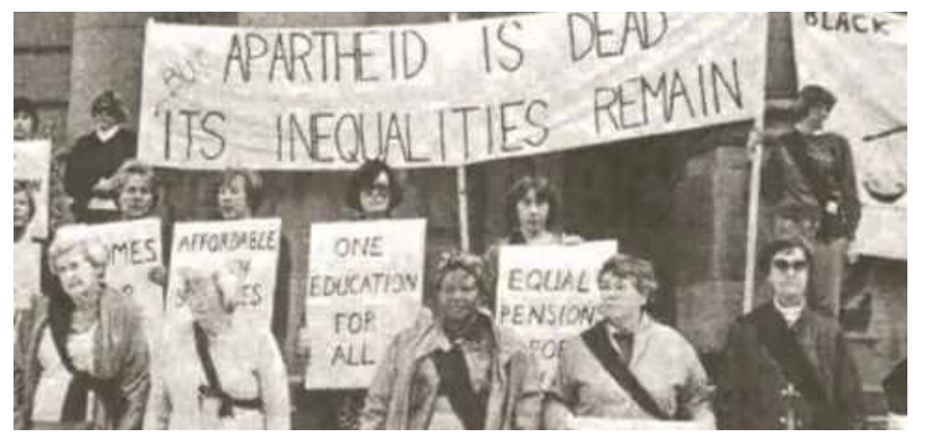
The Black Sash Society demonstrating in South Africa in 1954.

"NOSW gave me the knowledge and skills of how to approach going back to school,"