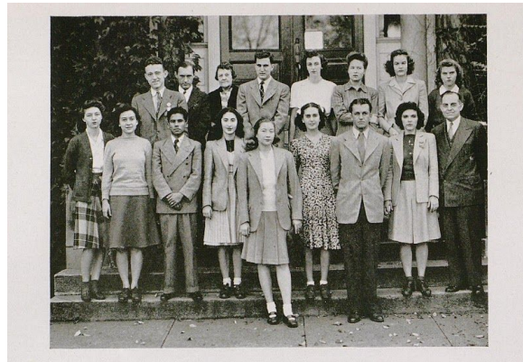
Cosmopolitan Club 1945

While analyzing history of the University after the first ten years of its inception, the focus on the first students of Latin American descent at the University of Kentucky shifted to collective student efforts. The Cosmopolitan Club provided a space for students from the United States and international students to gather and learn from one another. The organization's presence throughout the twentieth century, existing as early as 1912 but being officially founded in 1921, held a strong influence on the infrastructure of culturally-based student organizations at the University of Kentucky. The long-lived student organization catered to meet the needs of international students throughout their endeavours navigating the University of Kentucky. While their presence tapered off in the early twenty-first century, the Cosmopolitan Club's student-led efforts to showcase underrepresented communities and encourage cross-cultural relations continue to exemplify the unity through diversity Latino-student serving organizations emphasize today.