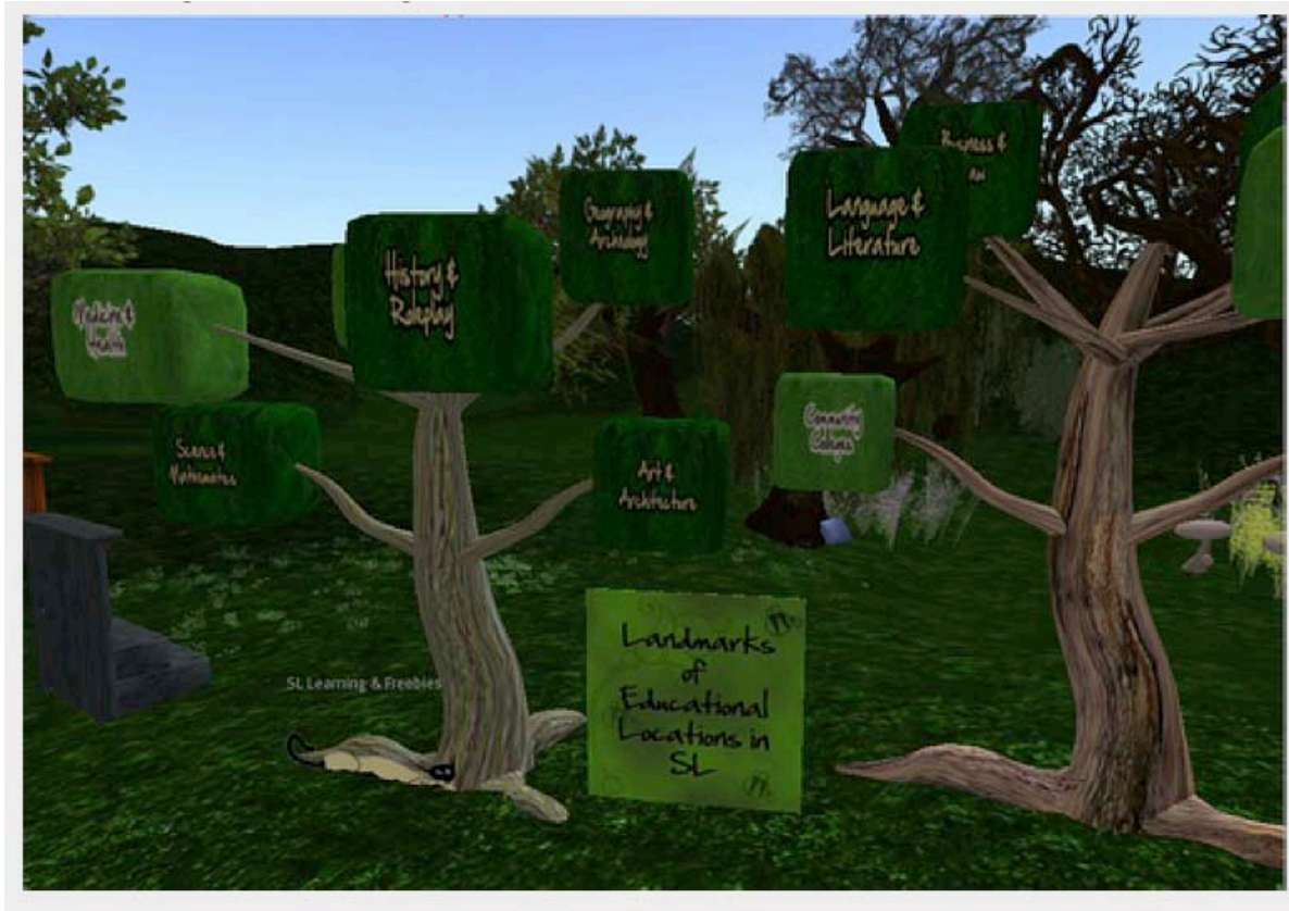
Figure 4. Image of the subject and locations guide (“Landmark Trees”) in Second Life, created by the College of DuPage.