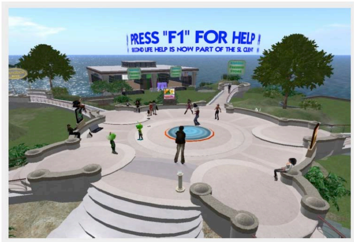
Figure 5. Image of “Help Island” in Second Life, created by Linden Lab.

This research showed, however, that librarians also have opportunities to make connections via groups in SL and through the many professional organizations in SL such as the ALA, ACRL and others, where members offer help and are glad to mentor librarians new to SL.