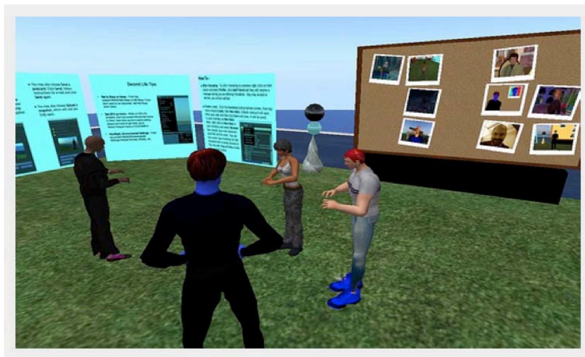
Figure 2. Traditional reference services being conducted in Second Life.

tems became clear to many institutions. Second Life and other virtual worlds are being used by some institutions as teaching platforms (Dewey, 2004; Kapp & O'Driscoll, 2010; Thomas & Brown, 2011). Some believe SL is closer to face-to-face course experience as it is a live synchronous system as opposed to the asynchronous LMS. Tools such as Sloodle (Kemp, Livingstone, & Bloomfield, 2009), designed to bridge SL and Moodle (an open-source LMS), can be utilized to combine the benefits of both synchronous and asynchronous teaching and learning, which some argue is best pedagogically and can be especially useful for distance education (Johnson, 2006).