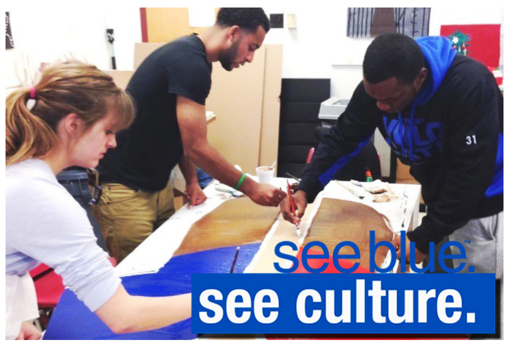
UK students participating in "Pathways to Creativity through Visual Arts."