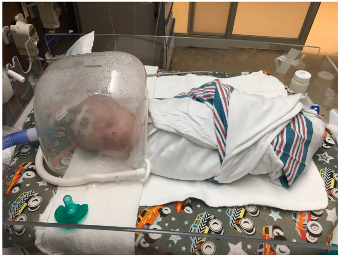
Fig. 2. Postoperative oxyhood setup.

under non-invasive ventilation requiring intubation and transfer to a tertiary care NICU for definitive care.