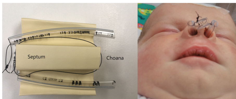
Fig. 3. Endotracheal tube bridge with retroseptal, extraluminal suture.