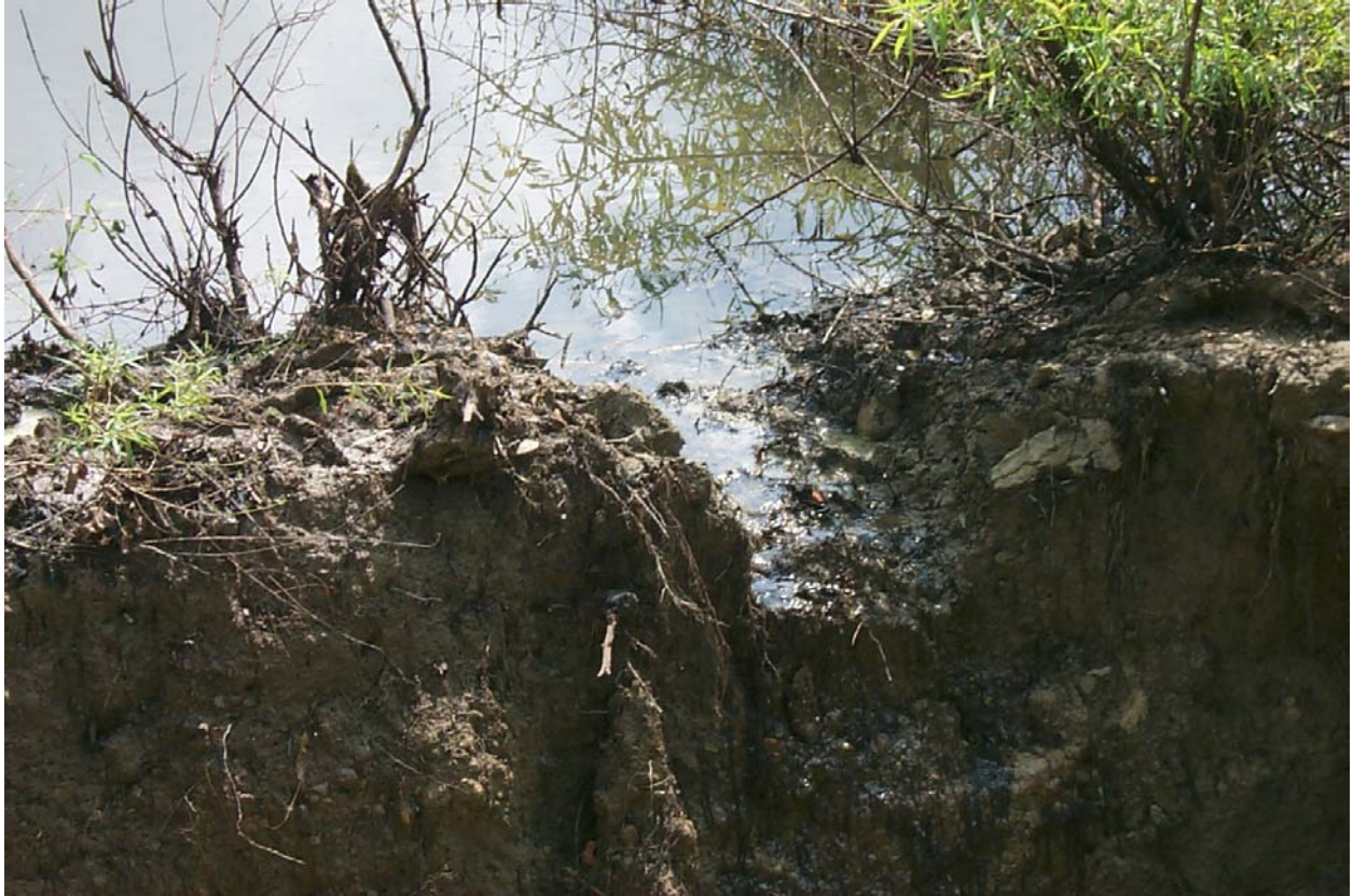
Where the pond side of the trench gave way, flooding the trench with mud, sludge and water.