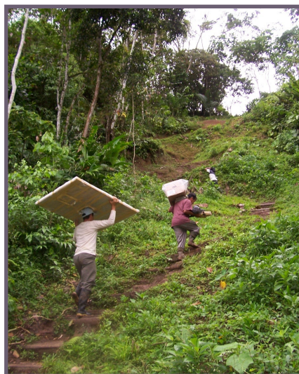
When the school in Jatun Molino needed resources, laptops and a solar panel were brought in by canoe and carried up the hillside to the village.