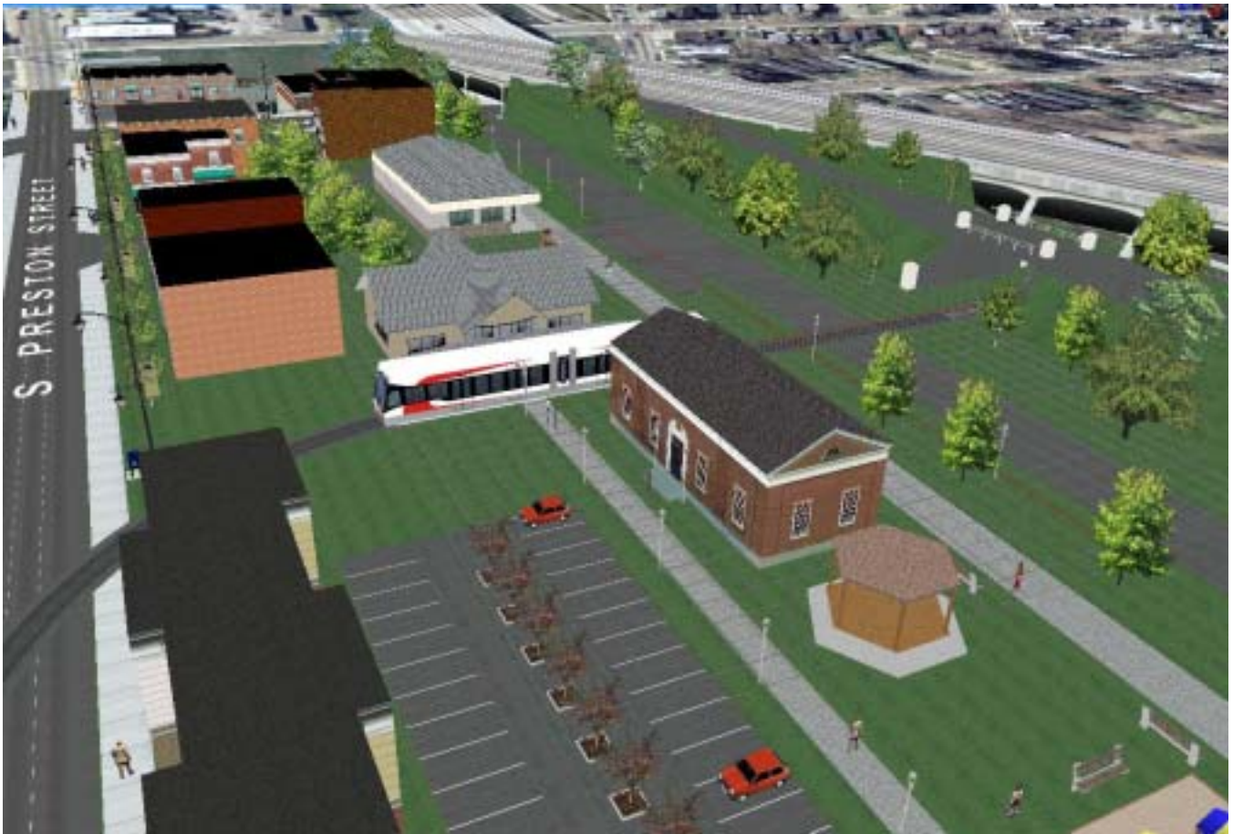
Figure 3. Preferred Scenario – An example.