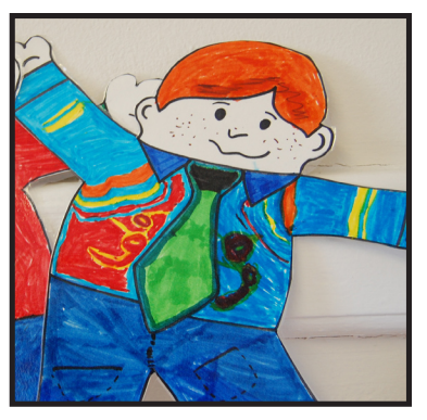
A "Flat Stanley" from Cassidy Elementary School.

The Flat Stanley project is an international literacy and community building activity for students, based on the 1964 children's book "Flat Stanley." Participants travel with their Flat Stanley and