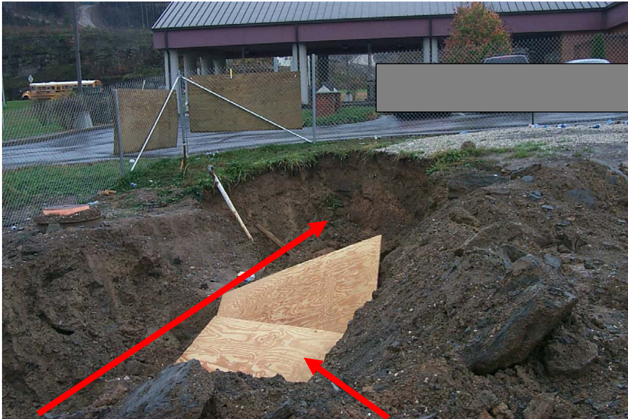
Location of victim in trench when sides collapsed. Plywood used by emergency response personnel.

Kentucky Fatality Assessment and Control Evaluation Program Kentucky Injury Prevention and Research Center 333 Waller Avenue Suite 202 Lexington, Kentucky 40504 Phone: 859-323-2981 Fax: 859-257-3909 www.kiprc.uky.edu