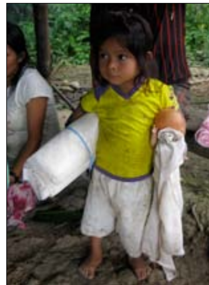
A young Jatun Molino resident carries her family's new mosquito net.

The most arduous part of the process was transporting the items to Jatun Molino. During the last part of the journey, community members guided them on an 8-hour trip downriver in a motorized, dug-out canoe and then helped carry the supplies up a treacherous muddy hillside to the community.