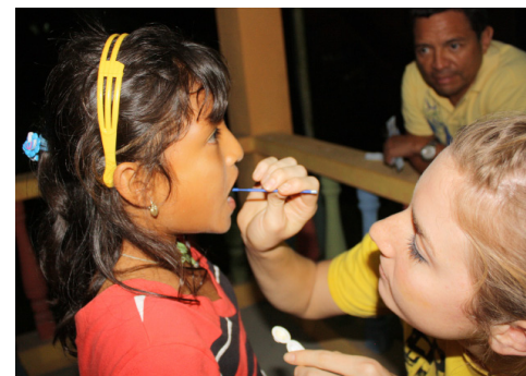
Study abroad student applying fluoride varnish