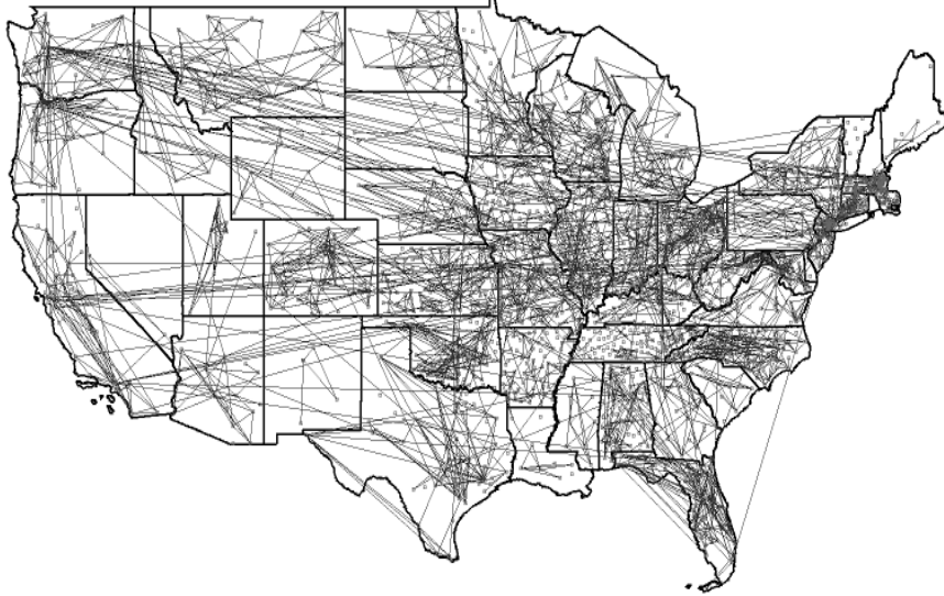
a) health officials' information network