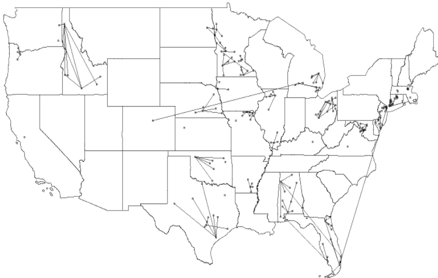
c) information spreaders and their contacts