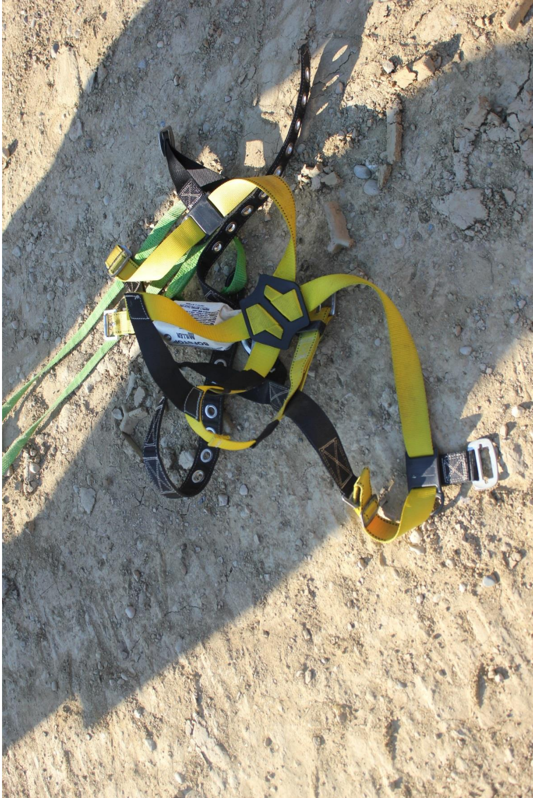
Picture of harness worn by foreman.