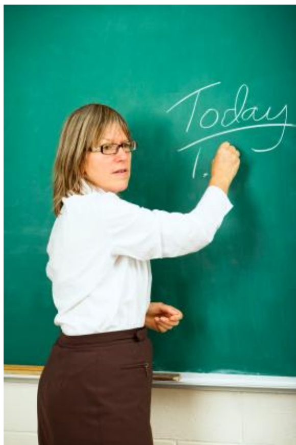
Figure 1. The model of a dowdy schoolteacher is often a conservatively styled in bland dress with glasses.

Physical bodies are always present, and it is precisely their constant existence that makes them less visible. The presence of bodies is expected, so they go unnoticed. When they do become a matter of focus, bodies are easily objectified, moving from whole person to body parts (e.g., breasts) or things (e.g., a hairstyle). For example, clothing, as portrayed in drawings and pop culture, is a site that informs limits of acceptable teacher bodily appearance. According to Weber and Mitchell's [23] analysis of over 600 drawings of teachers by both students and teachers themselves, female teachers are most often drawn with their hair in a bun, wearing glasses and pearls, and usually a wide or sack-like skirt. The majority of students invoked the iconic image of a teacher, which as described by MacLure [22] is a modestly dressed woman, standing in front of students, with a nearby blackboard or presentation surface. Weber and Mitchell [23] found that when any images did rupture this idea of teacher, the teachers' bodies were portrayed as fantastical figures in a far-fetched context (e.g., a teacher as a flying fairy), reinforcing the dowdy cultural model of teacher (See Figure 1), and nearly everything else is abnormal.