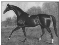
The Darley Arabian 1

Modern Thoroughbreds trace their lineage to a stock of Arabian horses imported into England between the late 1600s and early 1700s.