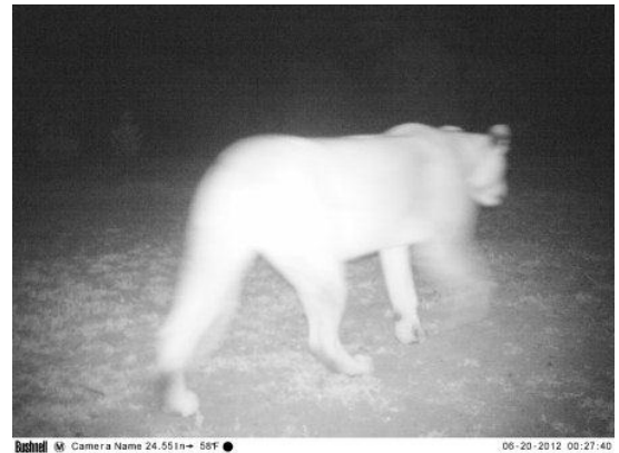
Figure 2 Camera trap picture of an Ilki Sieu Sieu female lion.

A complication with understanding lion home range size is that their territories expand and contract depending on the season and the amount of rainfall that has been received. On arrival in Naboisho this year Kenya had experienced one of its wettest years in recorded history and because of this many of the already profiled lions had completely disappeared from their traditional home ranges. I was tasked this year to track and relocate these missing lions as well as concentrate on completely identifying the Ilki Sieu Sieu pride. In the two and half months that I was able to work in Naboisho my team and I relocated the Enoolera and Enesikiria prides, and through the use of camera traps successfully located 2 adult females lions within the Ilki Sieu Sieu pride. Through these camera traps we were able to concentrate on specific areas with our vehicles, and in late June we were finally able to make visual confirmation and profile these individuals. These findings provided crucial information to conservancy management that aided them in developing better grazing plans for cattle that minimized human wildlife conflict within the conservancy.